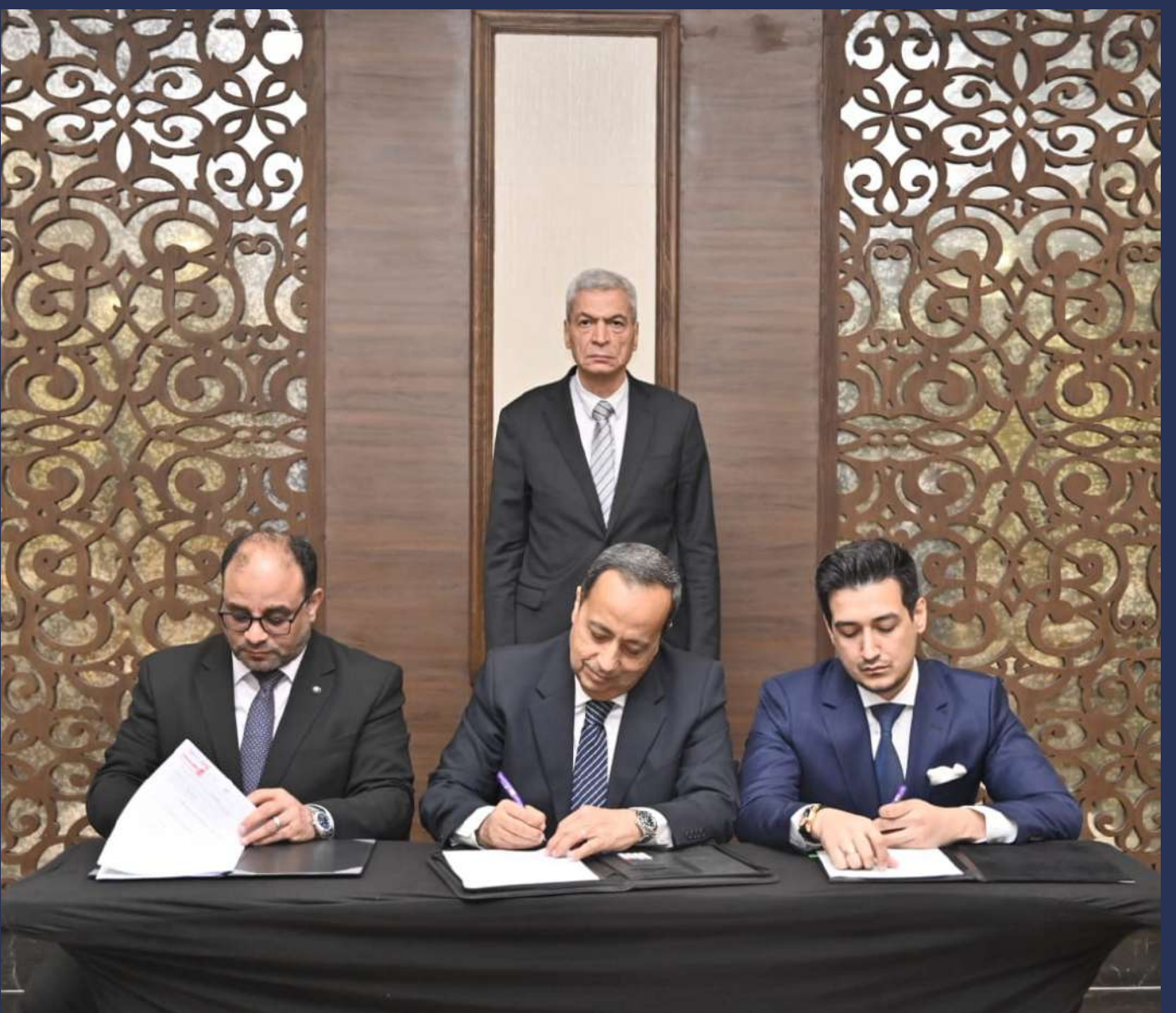
Memorandum of Understanding between Moharram & Partners | Public Affairs and Strategic Communications (M&P) and Access Health International to initiate transformative healthcare projects across Africa